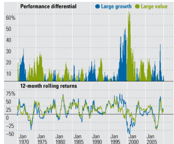
One-Year Growth and Value Cycles: 1970–2010

Performance differential measures the outperformance of one asset class over the other using 12-month rolling returns. This is for illustrative purposes only and not indicative of any investment. An investment cannot be made directly in an index. Past performance is no guarantee of future results. Returns and principal invested in stocks are not guaranteed.